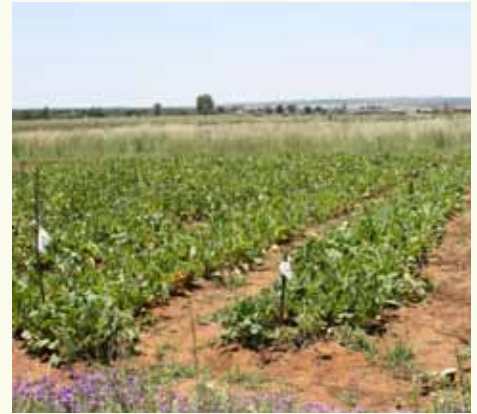
St. Joseph's vegetable garden