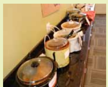
Submissions to First Annual Calgary Chili Cook Off

On November 27th the Calgary AB Canada office hosted its first Annual Calgary Chili Cook Off during their WAAM (Weekend Attitude Adjustment Meeting). The contestants had to enter one of the 4 categories: Traditional, Hot & Spicy, Exotic/Non-Traditional and Vegetarian, in order to participate. The judging was based on overall taste and two winners places were selected per category - first place and runner up. After judging, the remaining chili was sold to raise funds for the Golder Trust for Orphans and $682.00 was raised! Well done, chefs!